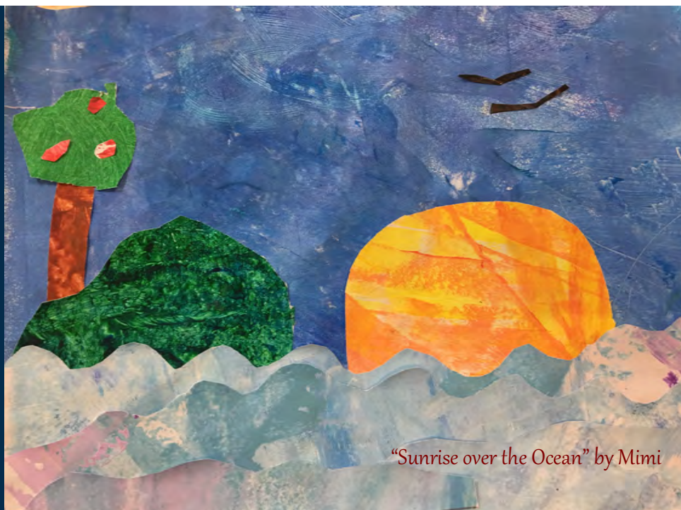
"Sunrise over the Ocean" by Mimi