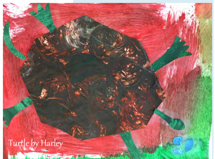
Turtle by Harley