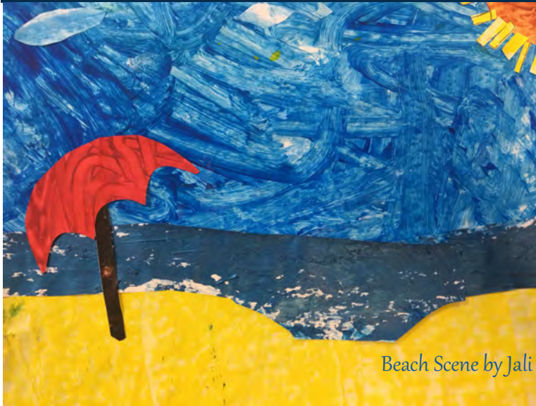
Beach Scene by Jali