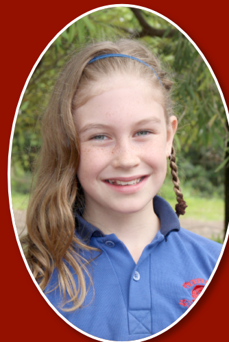
Ella Focus on Learning