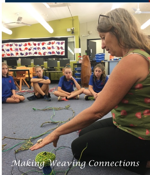
Making Weaving Connections