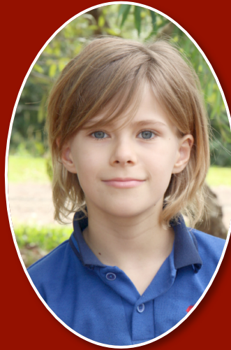
Sophia Focus and Determination: Reading