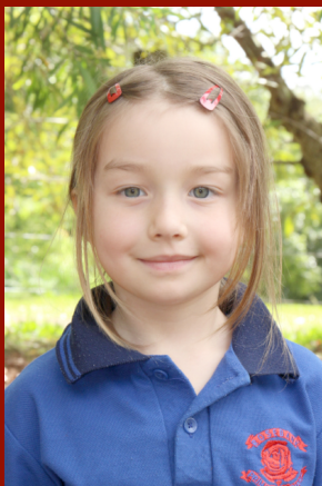
Jali Focus during Writing