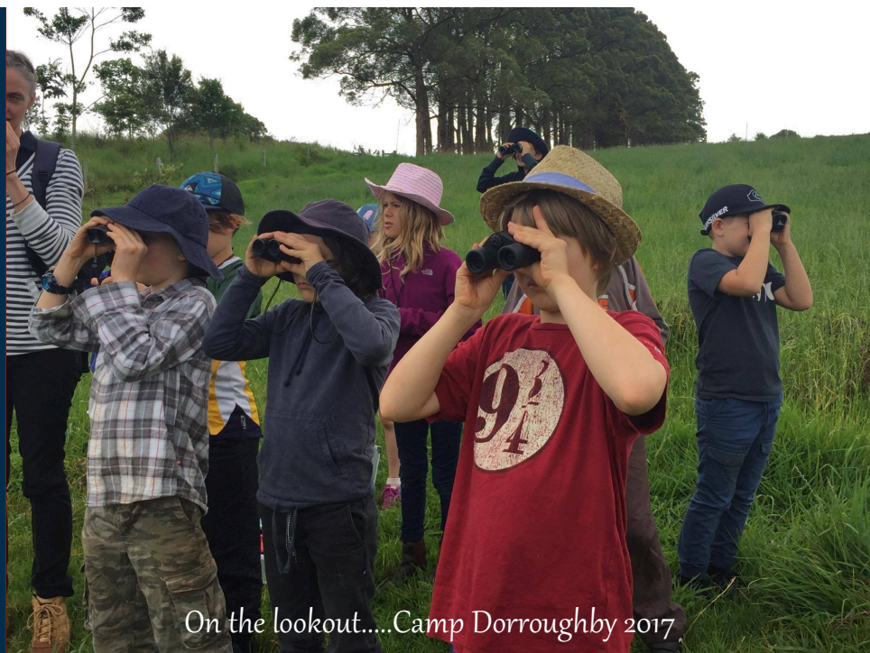
On the lookout.....Camp Dorroughby 2017