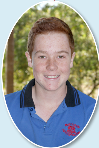
Fergus Achievement: Maths