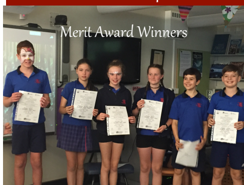
Merit Award Winners