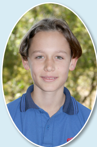
Jayde Beautifully Structured Writing