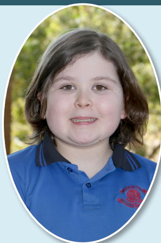
Anna Beautiful Art