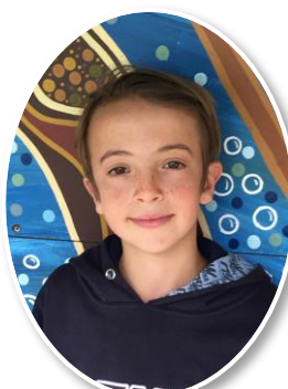
Tavi: Considering Others