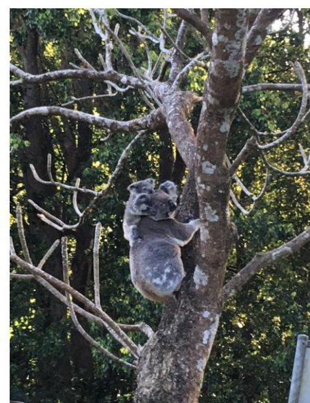
Look who visited us today