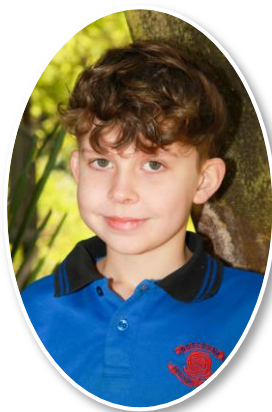
Cassidy: Thoughtful Goal-Setting