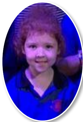
Sunny : Impressive Independent writing