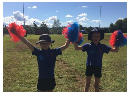
Rise Up, Rosebank 2016