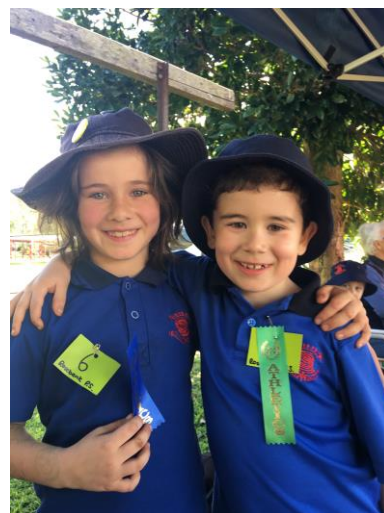
Winners are Grinners!