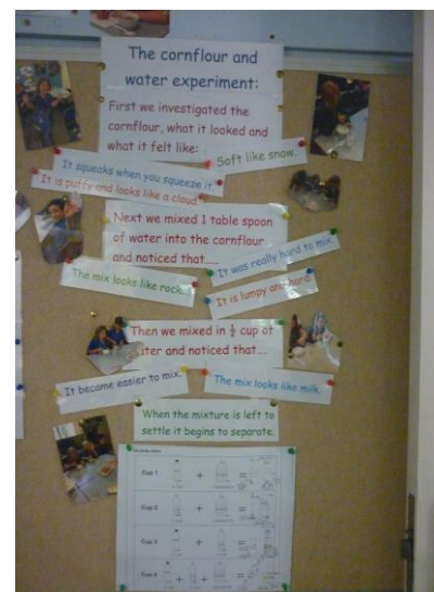
K-3 Cornflour and Water Experiment

Children must bring a Library bag to be able to borrow Library books from the Library. We have lots of new Library books for borrowing and we need to keep them protected so other students can borrow.