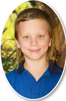
Te for Mastering new Mathematical concepts