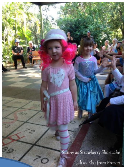
Sunny as Strawberry Shortcake Jali as Elsa from Frozen

Remember: Canberra EOIs must be in by TOMORROW! Year 5 and 6 only