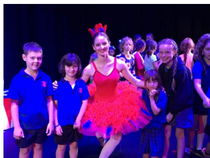
Starstruck Rosebank Students at Byron Ballet's production of Peter and the Wolf