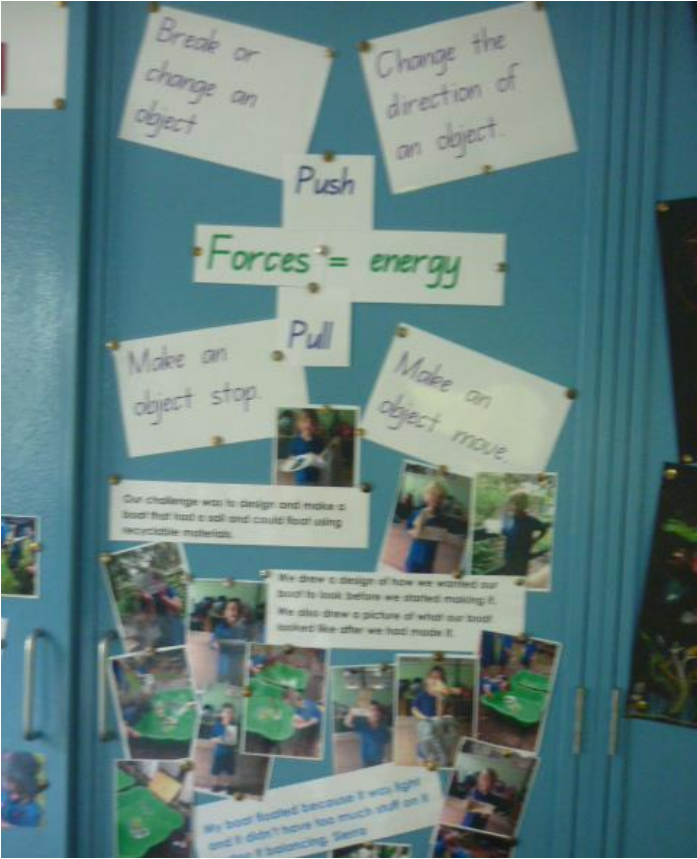
Push and Pull K-3 Making boats to sail