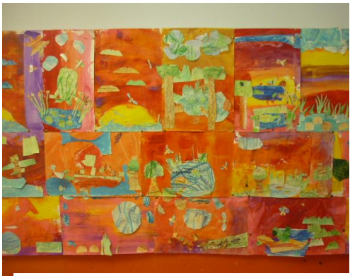
Artwork K-3 Ponds using mixed media