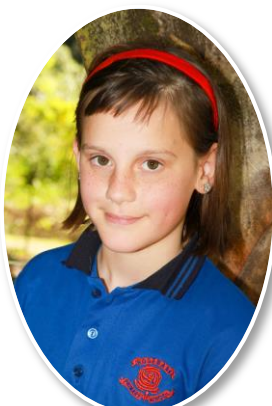
Felicity for Outstanding Peer Support