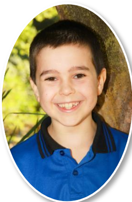
Cosmo, for Maths Mastery