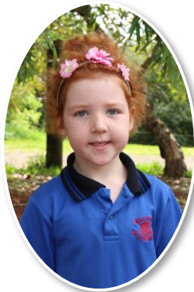
Sunny: Happily helping out all week