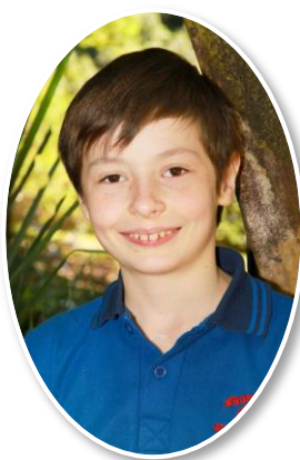
Bodhi: Scintillating Scientific Synthesis