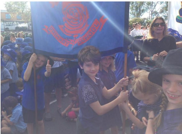
ANZAC Day Marchers...Harley helping out at the start