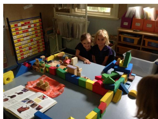
Rainy Day Cooperative Play Session: