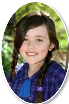
In the Dolphins (Gawandi), Eden for Powerful Persuasive Writing