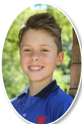
In the Wombats (Juluhgran), Ashley for Personal Integrity