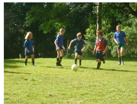
Some photos from the Soccer team try out