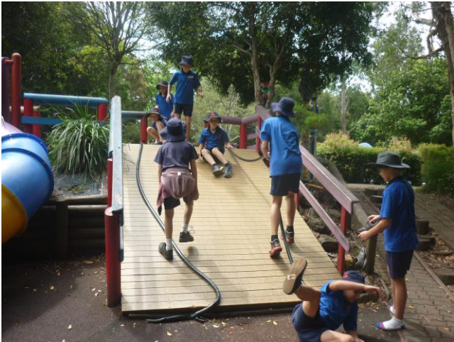
Fun in the park on Tuesday after visit to the Art Gallery and Library.