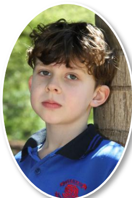
In the Dolphins (Gawandi), Cassidy for Fantastic Classroom Focus