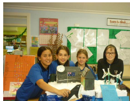
Antarctic Base Stations