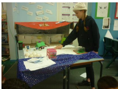
Antarctic Base Stations