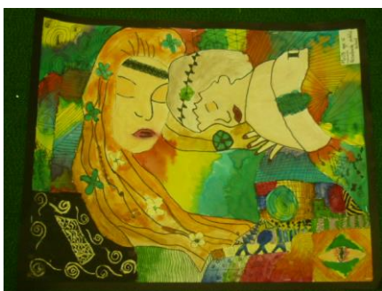
Mollie and Gabe Art Work from Art Smart