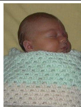
Still serene after all these years