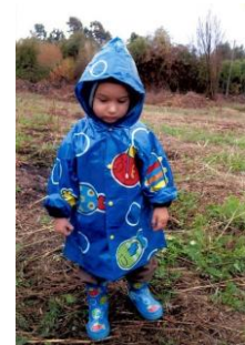
And this rainy day friend