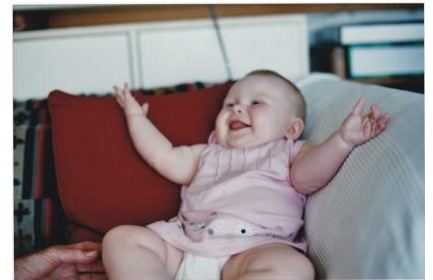
Check out this little cutie? Who could it be?