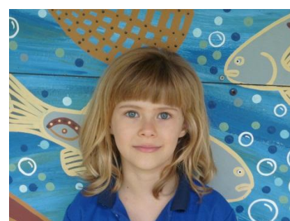
Year 4/5/6 Sidney Nolan 'Ned Kelly' Artworks